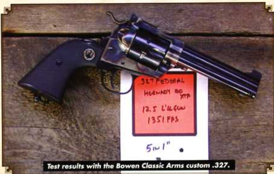
Test results with the Bowen Classic Arms custom .327.

This special Colt Single Action is chambered in Hamilton's favorite cartridge, at least it appears to be so to me, from meeting with him at many