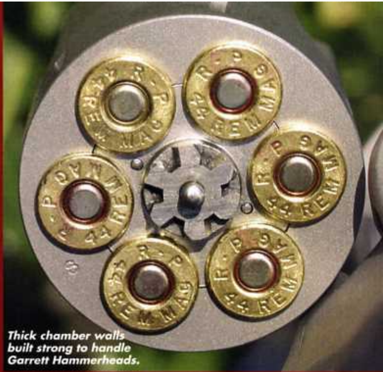
Thick chamber walls built strong to handle Garrett Hammerheads.