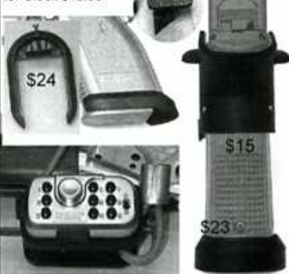
Mechanical Push Button Trigger Lock $19