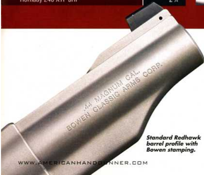
Standard Redhawk barrel profile with Bowen stamping.