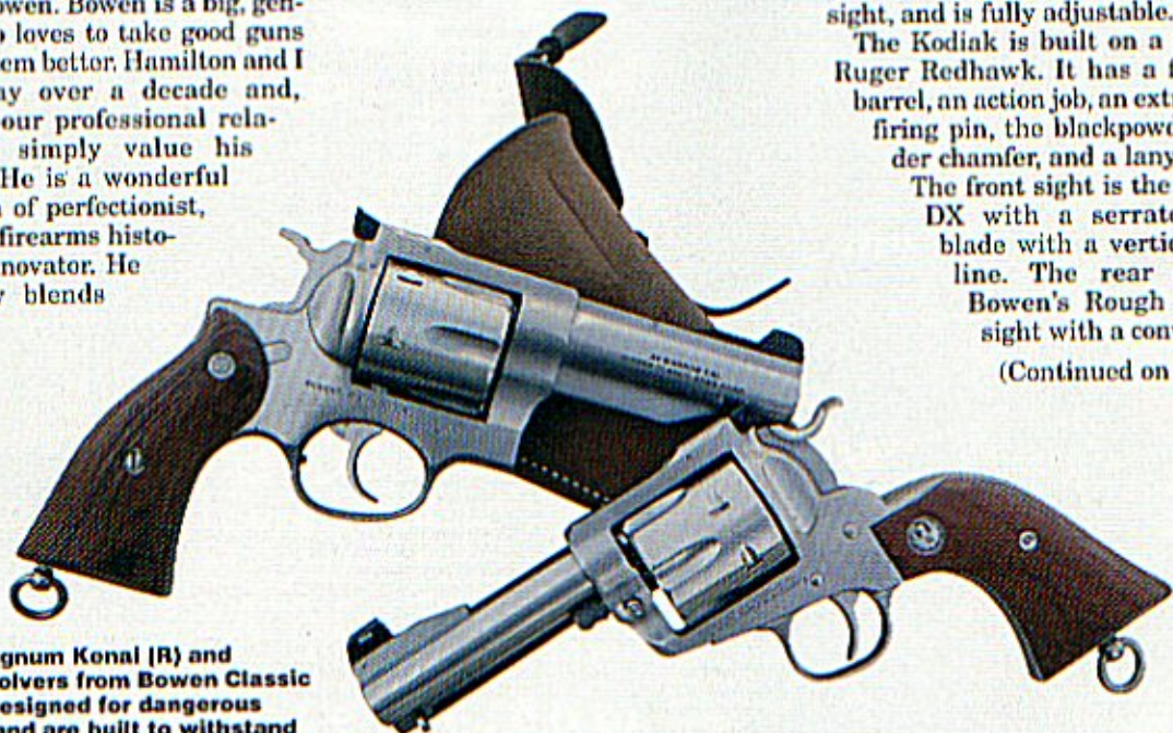
The .44 Magnum Kenai (R) and Kodiak revolvers from Bowen Classic Arms are designed for dangerous game use and are built to withstand the rigors of rough country.